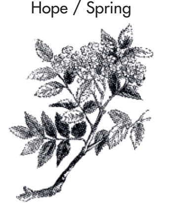
ROWAN (Sorbus Aucuparia) Courage, Wisdom and Protection