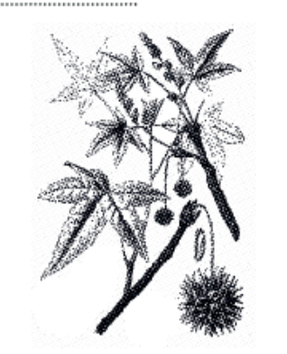
SWEET GUM (Liquidambar Syraciflua) Family / Inner strength