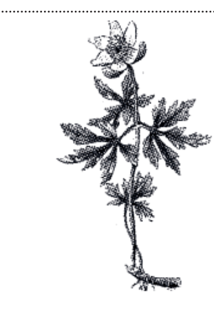
WOOD ANEMONE (Anemone Nemorosa) Sadness