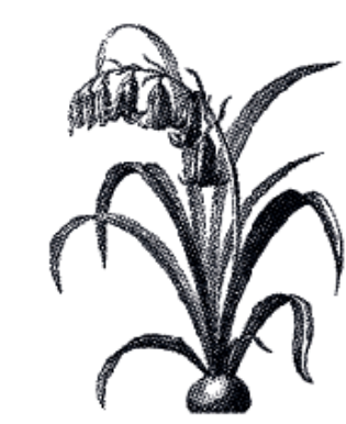
BLUEBELL (Hyacinthoides Non-Scripta) Constancy / Humility