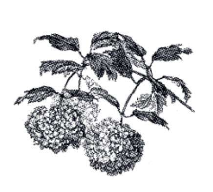
GUELDER ROSE (Viburnum Opulus) Memory