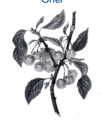
GREAT WHITE CHERRY (Prunus 'Tai-Haku') Spring / Endurance