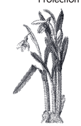
SNOWDROP (Galanthus Nivalis