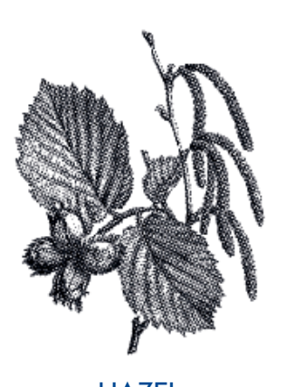
HAZEL (Corylus Avellena) Wisdom