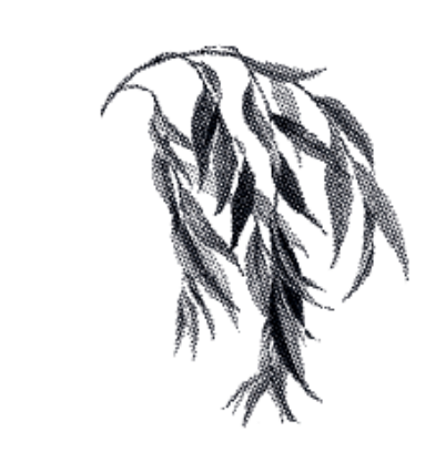
GOLDEN WEEPING WILLOW (Salix x Sepulcralis 'erythroflexuosa')