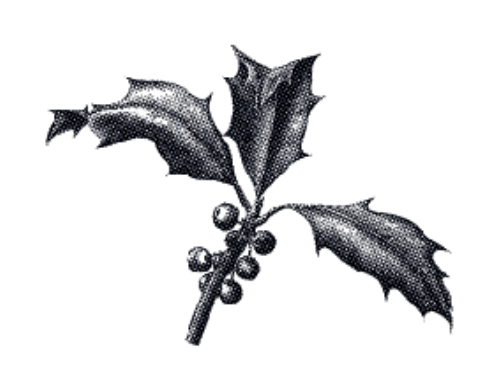
HOLLY (Ilex Aquifolium) Protection