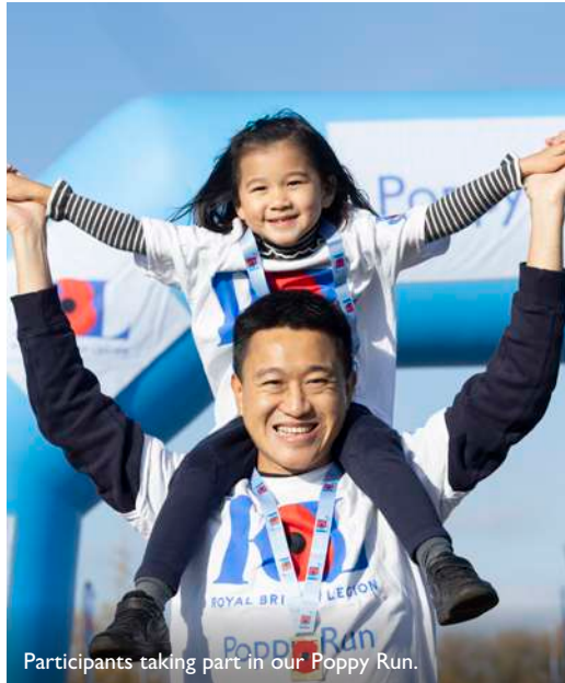
Participants taking part in our Poppy Run.

There is a lot to be excited about next year. See how you can get involved.