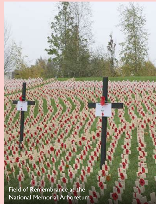
Field of Remembrance at the National Memorial Arboretum.